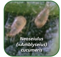
Neoseiulus (=Amblyseius) cucumeris