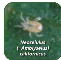
Neoseiulus (=Amblyseius) californicus