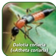
Dalotia coriaria (= Atheta coriaria )