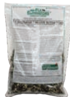
Fly Eliminators and wood shavings in packaging.