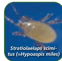
Stratiolaelaps scimitus (= Hypoaspis miles )